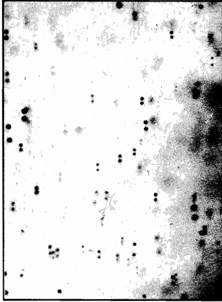
Aerosol droplets photographed using a two-flash PALFLASH with exposure time of 300 nsec, moving at 2.7 m/sec. Average size of particles 100 \mu m.