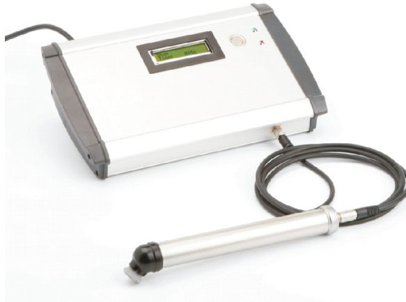
FIG. 2: The PlasmaDerm VU-2010 device constructed by CINOGY GmbH, Duderstadt, Germany, showing the control unit with a start button and timer display and the hand-held plasma applicator.

distance between the DBD electrode and the skin are ensured by applying a specially constructed, sterile, and ready-to-use spacer. If direct contact of the DBD electrode with the skin occurs, the air discharge—and thus the plasma generation above the skin—stop. This is completely harmless.