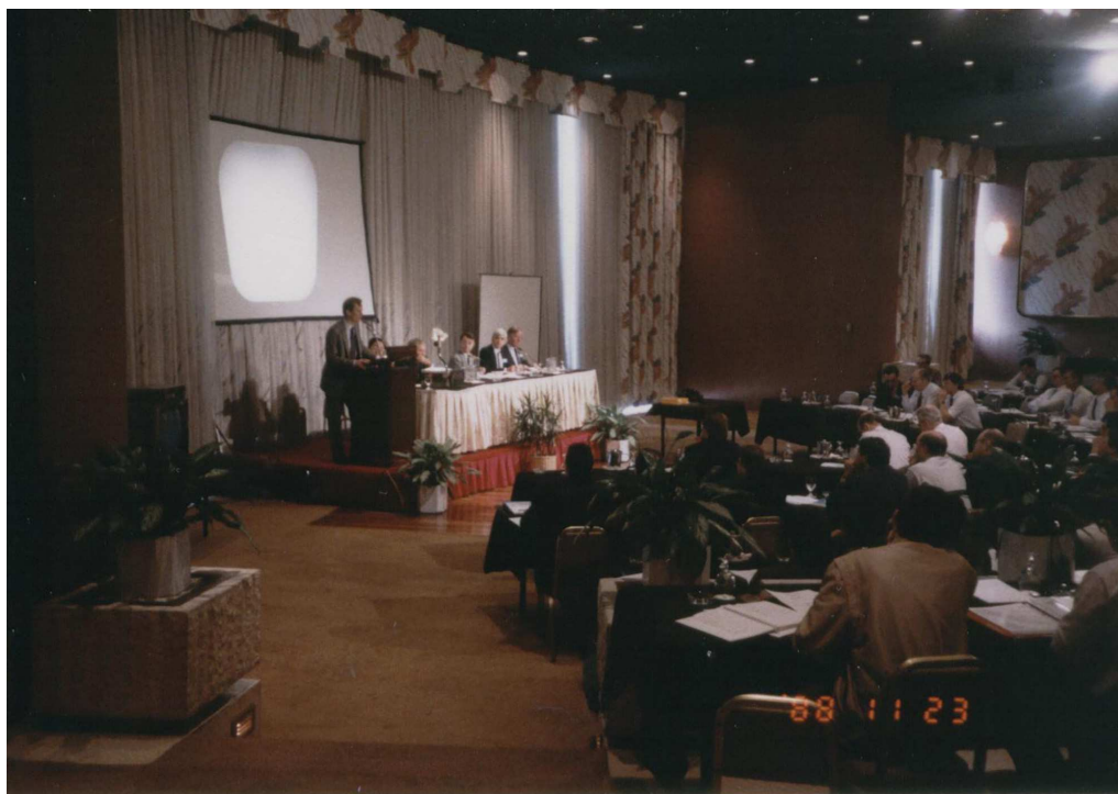
Opening remarks at the 1st ISICP