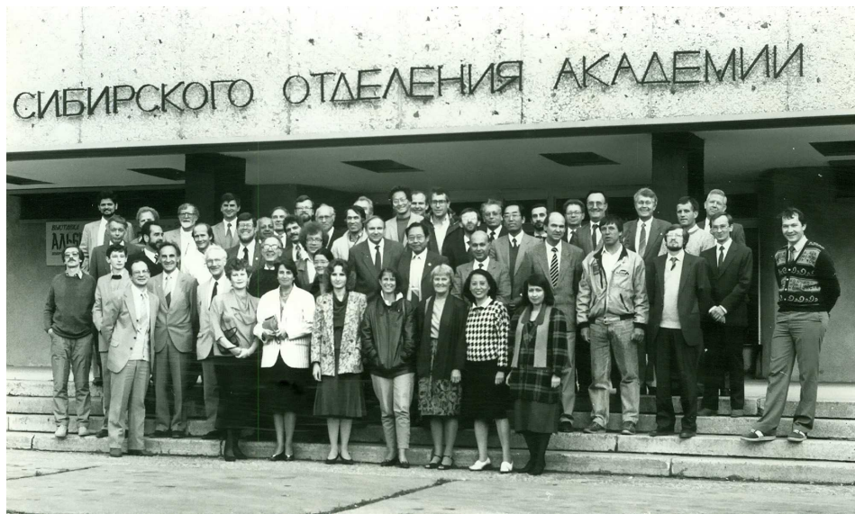
Group photo of the IV International Seminar on Flame structure, Novosibirsk, Russia, in 1992