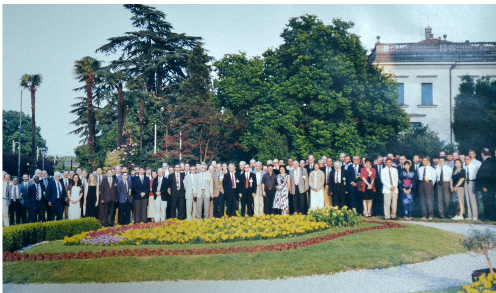
Participants photo in front of Regina Palace Hotel, venue of the conference